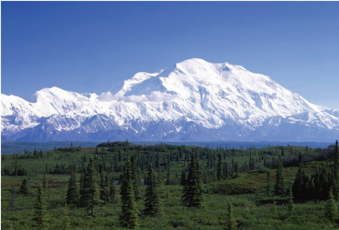
Summer - Denali

court supervision. During that decade, a court-appointed monitor periodically inspected the prisons. After years of supervision, the Alaska legislature passed the Alaska Prison Litigation Reform Act, which was intended to eliminate court supervision of the correctional system; in 2001, the Superior Court terminated the prospective relief created in Cleary , suspending enforcement of the population caps.