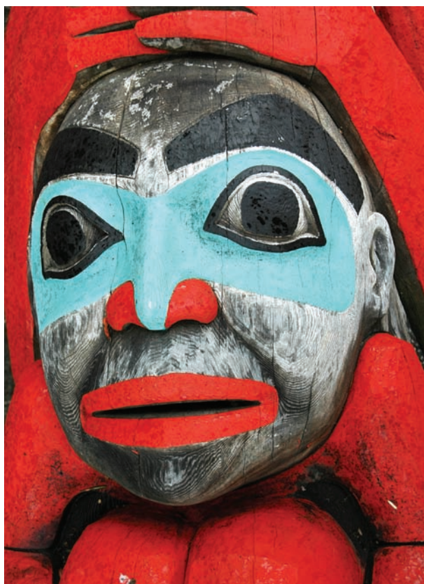
Totem Face

avoidance may promote guilty pleas. 484 Real disparities in treatment based on conscious or unconscious racial motives from judges, probation officers, attorneys, police officers, jurors, or other parties to the criminal justice process may also impact the proportion of Alaska Natives convicted of crimes and sentenced to incarceration in Alaska. 485