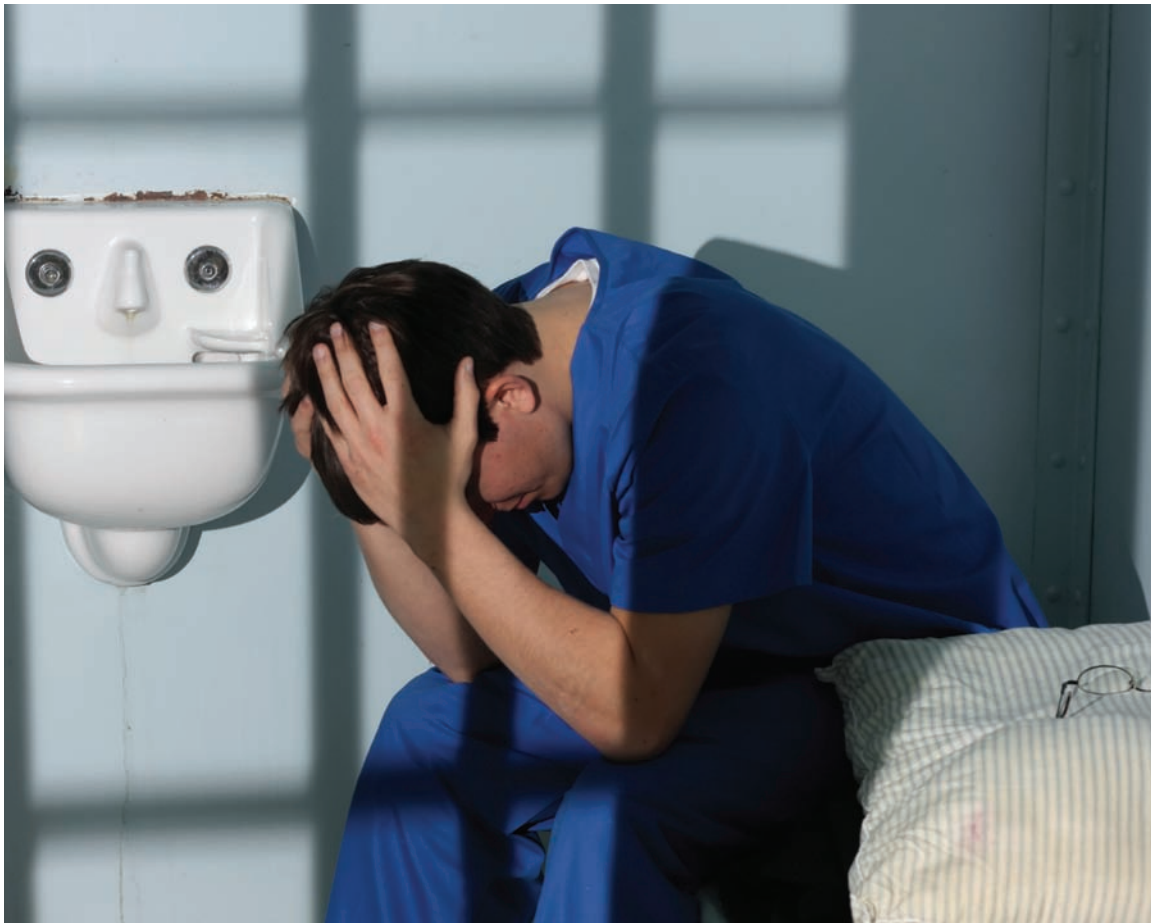
Prisoner

Both African Americans and Alaska Natives make up a disproportionately high percentage of Alaska's prisoners. Alaska Natives, who represent 18% of the state's population, com-