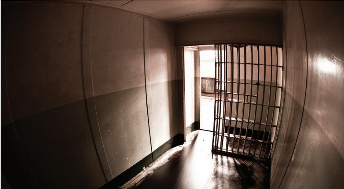
Prison cell interior

international human rights standards. 135