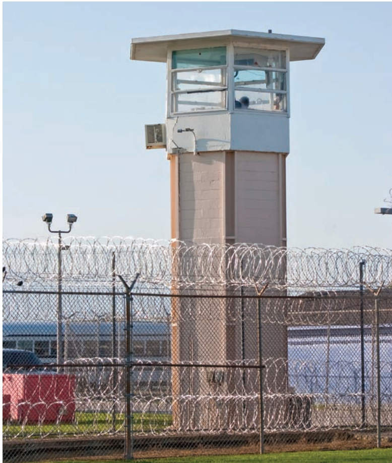
Guard Tower

not begin making consistent monthly visits until August 2007. 162 Since regular visits began in August 2007, however, the contract monitor has made regular visits and sent regular memos on her visits to the Department of Corrections. 163 Even when states carefully monitor the conditions at contract facilities, enforcing the terms of a contract can prove challenging against a private entity determined not to comply. Where the amount of money at stake is less than the cost of conducting the litigation, even an identified problem can prove challenging to fix.