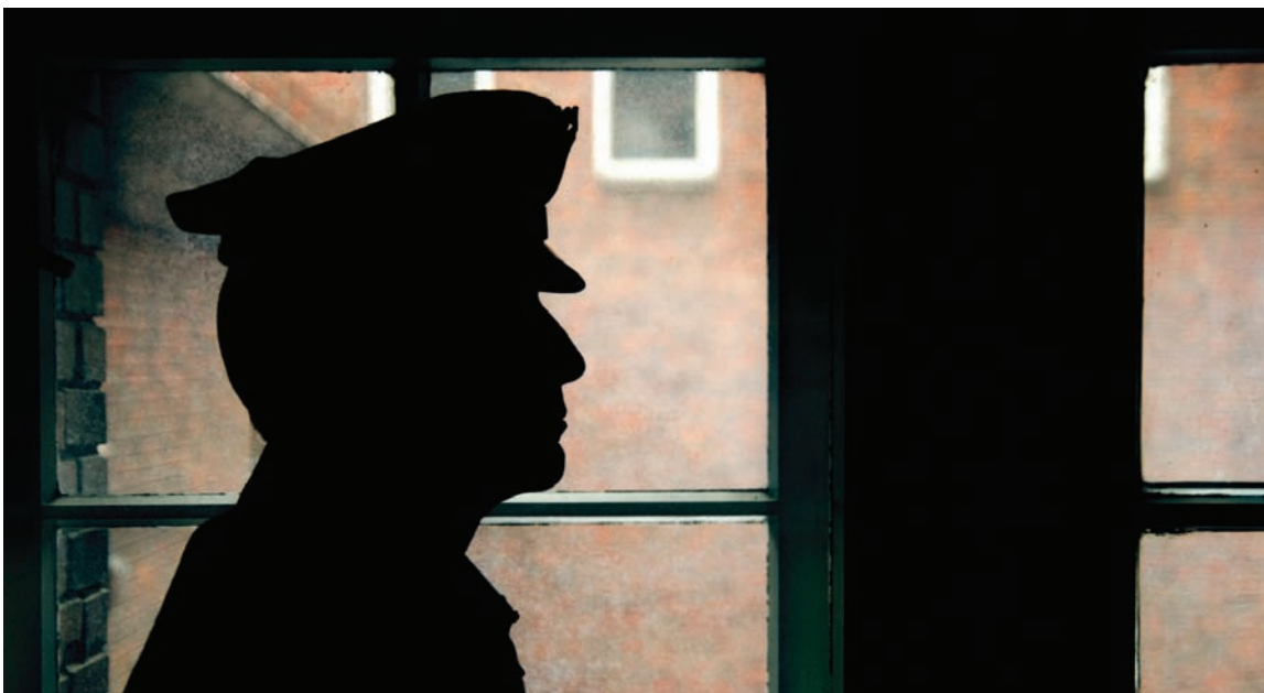
The warder

however, since prisoners may not even know how to contact one. The ombudsman has limited power to resolve incidents, usually making recommendations to any department or agency in the event of a negative finding. The ombudsman has no power to investigate out-of-state incidents at contract facilities. The Ombudsman's office is not in the chain of response to prisoner grievances; only those prisoners who know about the Ombudsman's office and seek the Ombudsman's assistance on their own get help. Last, the ombudsman serves the whole of state government, not merely the prison system, leaving a crowded docket of complaints of all sorts; it has not opened an investigation into the Department of Corrections since 2007. 448 The ombudsman's office, currently with a staff of 11, has completed 21 full investigations into the Department of Corrections since 1990, slightly more than one a year. 449